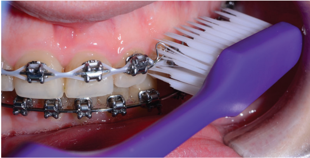
Figure 1. Toothbrush with ultra-thin bristles