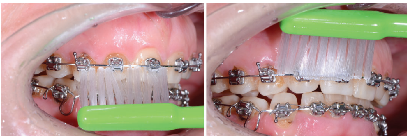
Figures 3a-b. Two-row dental brush