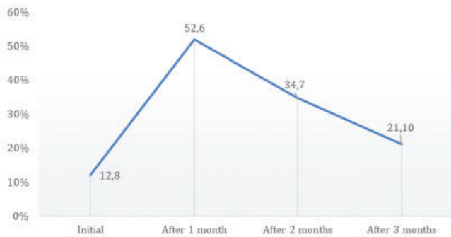
Figure 6. O'Lyrey dynamics at various monitoring periods (mean, %)

Nevertheless, the best oral hygiene values were observed at the end of the third month. At this control period oral hygiene index reached mean value of 21.1±4.9%, which evidenced good oral hygiene while wearing braces.