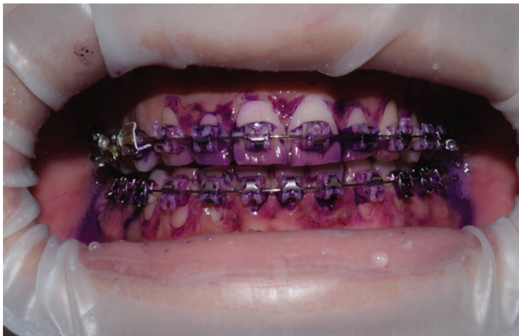
Figure 5. Teeth staining for O'Lyrey plaque-test

After patients changed toothbrush by the V-shaped toothbrush specially designed for clinical situation with braces, the hygiene index during the second month decreased by 1.5 times to 34.7 \pm 6.1\% (Figure 6).