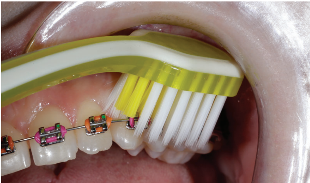
Figure 2. V-dental brush